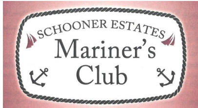
Chart your course now before you discover that there's a long list ahead of you. Get a proud sense of accomplishment that comes with planning ahead. Your enrollment in Schooner's Mariner's Club entitles you to the following privileges:

Perhaps it's time to move into a senior living community...but if you are a senior who is not quite ready for the move, consider joining our Schooner Estates Mariner's Club. A one time fee of $250.00 (used towards your first month's rent upon move in) enrolls you as a charter member of our illustrious "Mariner's Club." In addition to facilitating a timely admission to our community, it is our hope that by joining our club, you will now enjoy the peace of mind that comes with knowing that you have made a momentous decision, with benefits you will reap for years to come.