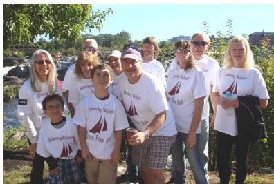
Our Schooner team at the Central Maine Heart Walk on September 15th.