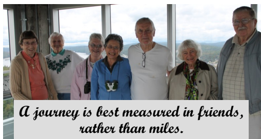
A journey is best measured in friends, rather than miles.

At Schooner, we have dedicated ourselves to our philosophy: to provide the opportunity to experience a gracious lifestyle for those who desire continued independence through active retirement, to present friendship and a feeling of belonging to a caring and interesting community. To help fulfill this commitment, we provide wonderful events and day and overnight excursions, giving all who live here the opportunity to be active and enjoy life. For your "viewing" enjoyment, here are a few photos, including our Fashion Show, Rangeley and Bar Harbor trips.