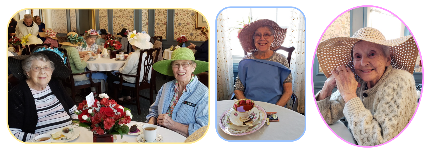
A Fine Tea Party!