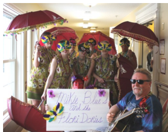
Mardi Gras 2013 at Schooner Estates