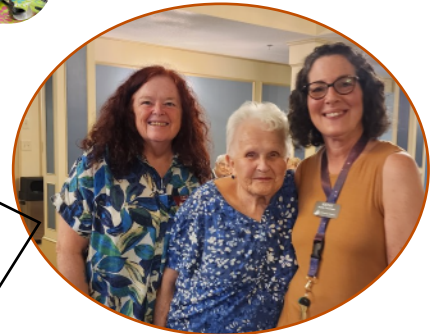
A fun Social Hour.