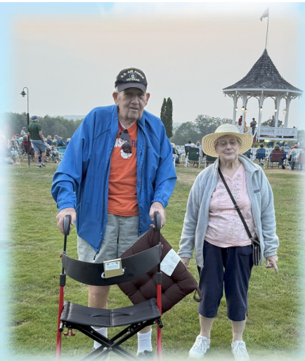
Good times were had this summer at the Poland Springs summer concerts.