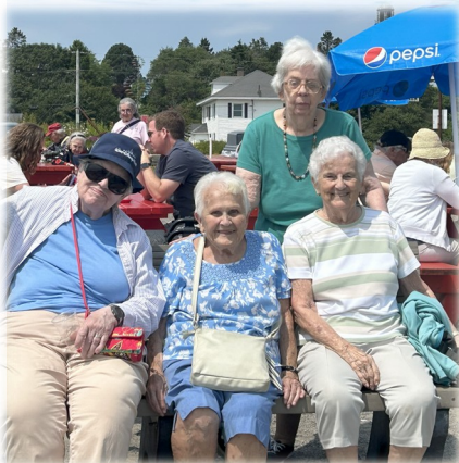
A wonderful day in Cape Elizabeth, at the Lobster Shack!