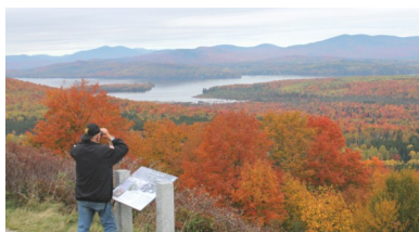
Spending the day in Rangeley

For those who gave it all so that we could be free... Thank You! Happy Veterans Day ~ November 11th ~