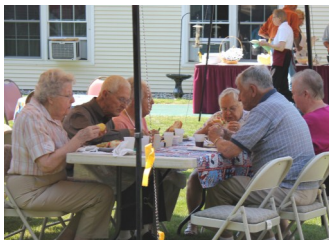
Schooner's Fall Harvest BBQ