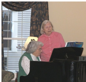
A bit of musical entertainment