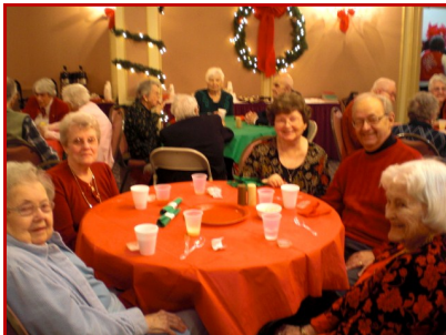
A festive holiday gathering at Schooner