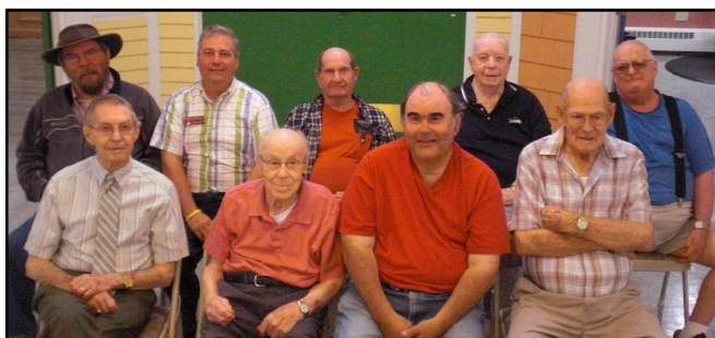
Schooner's 2011 "Gentlemen's" photo