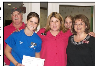
An enjoyable day at the McLaughlin flower gardens and lunch at Maurice's restaurant.