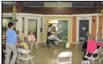
A group gathering in the Village Green to play sitterball