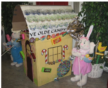
We hope that everyone had a very nice Easter!