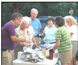
DOLLAR DOG NIGHT AT SCHOONER