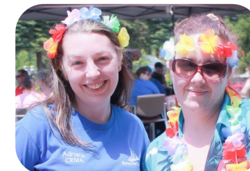
Looking forward to luau 2026!

Save the dates and make sure you don't miss out on one of these highlighted events. Before you know it, summer will be knocking at our door, letting us know that it's time to take the party outside! Our first outdoor get-together of the season, the Hawaiian luau barbeque , scheduled for Wednesday, June 10th , is just around the corner.